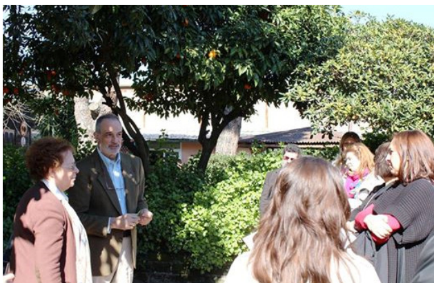
Scuola Viva onlus

During the morning of the first day the Italian partner invited the Colleagues from abroad to visit the Rehabilitation Centre “Scuola Viva onlus” in which he works. The Group was picked up from the hotel by a private bus that drove it to the centre and back. The visit provoked many encouraging comments and affirmative interest from the guests. In particular the partners were very interested to learn about the specific kind of services provided in an Italian rehabilitation centre for persons with ID. Some activities produced much interest, such as the art atelier, the handcrafts and the gardening with its various branches, particularly as vocational training for the clients. On the other hand both staff members and users of the centre were thrilled to receive so many professionals interested in their work and activities. The visit incorporated all aspects of the centre, with the delegates able to pick up new ideas to bring back home, and gain inspiration.